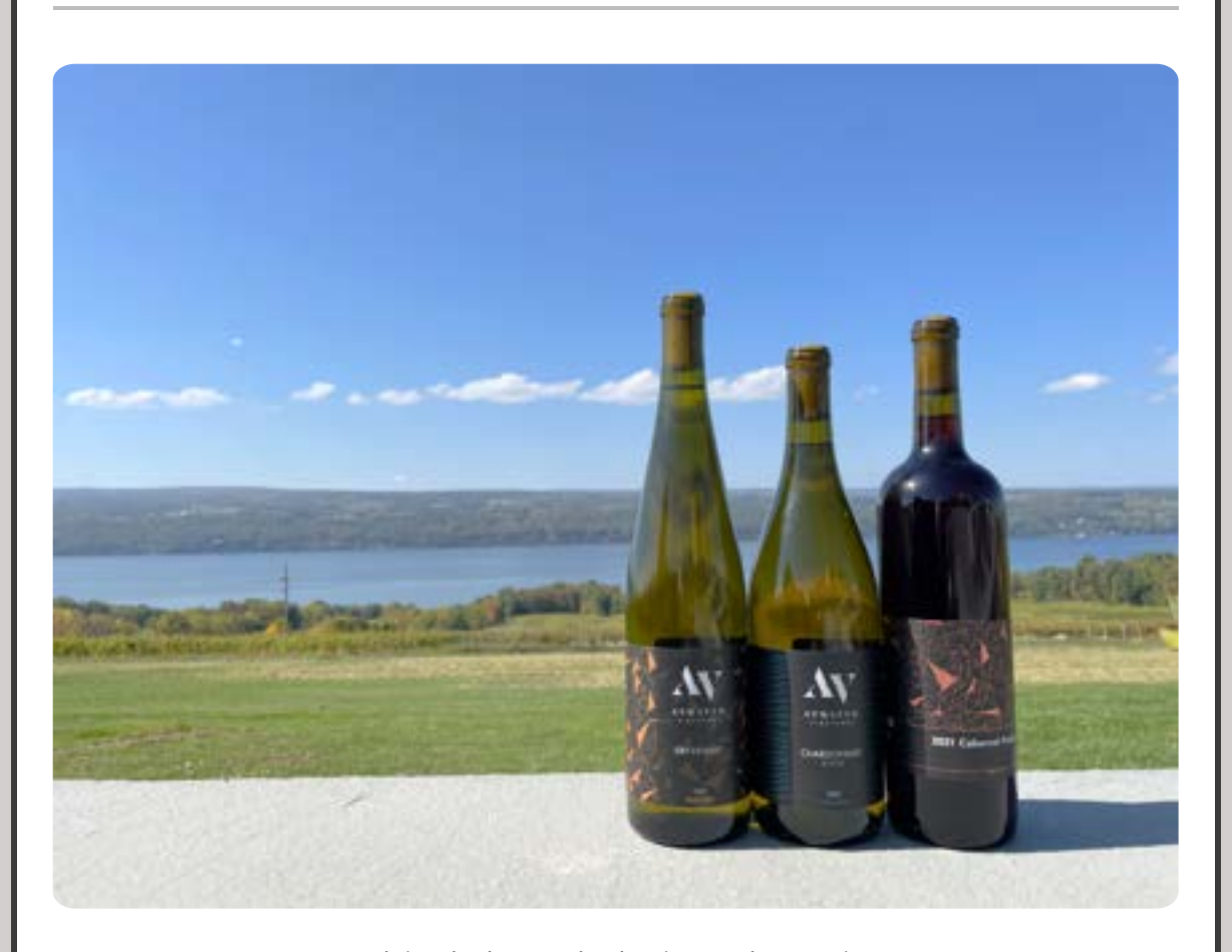
Behind the Label Virtual Tasting Thursday, December 7 6:30-8:00 p.m.

The Dry Rosé of Blaufränkisch 2022 is rich in quaffability. Notes of watermelon, blackberry, strawberry, and the light crunch of pomegranate seeds are balanced by refreshing acidity. Pair with Caprese salad or goat cheese crostini topped with prosciutto, melon, and honey.